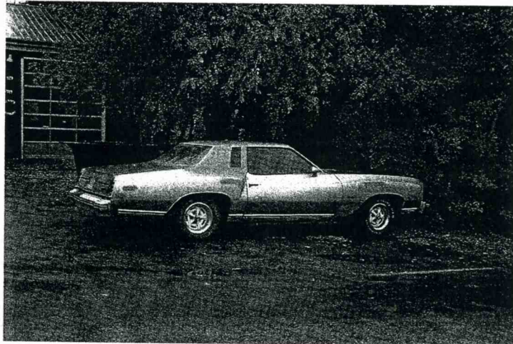
Fastwürms, Silverado, from Superstition, 1979 - 2000.

ing lands of the buffalo, a six-hour work week, and the formation of an alliance of elves, brownies, and aliens to oversee the end of the military industrial complex. Again, I get all misty. This gang has got a dance club called House of Bast where the house dance is kitten stroking. I heard that if you show up on karaoke night and can make your eyes glow in the dark like a cat's, you drink all night for free. All this right here in beautiful Ontario. If only the Fastwürms would put out an edition of Ontario Witch Hockey League cards, I