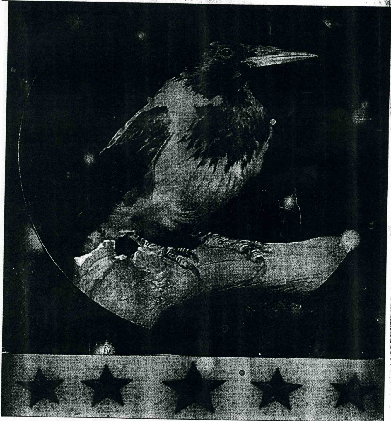
A bird's head always in profile: Milarepa l'invincible, one of the best works in Sylvain Bouthillette's mixed-media show. GUY L'HEUREUX GALERIE TROIS POINTS